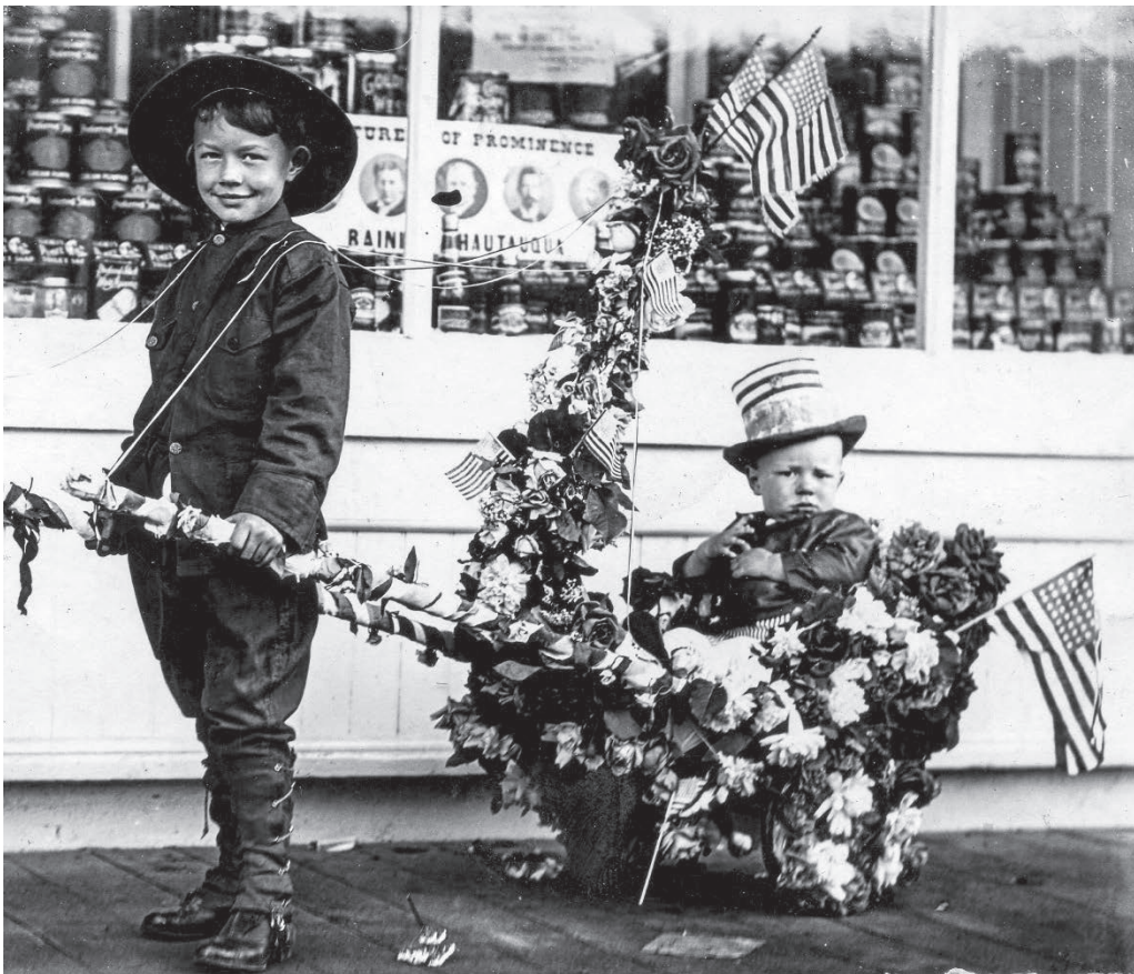
Fourth of July 1918 Celebration during World War I Boys dressed as doughboy and Uncle Sam Clatskanie, Oregon